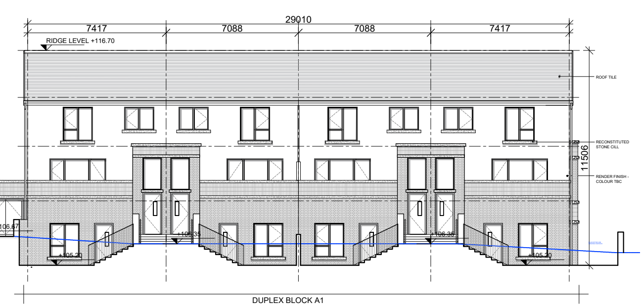
3 NORTH POINT South Facing Elevation 0451